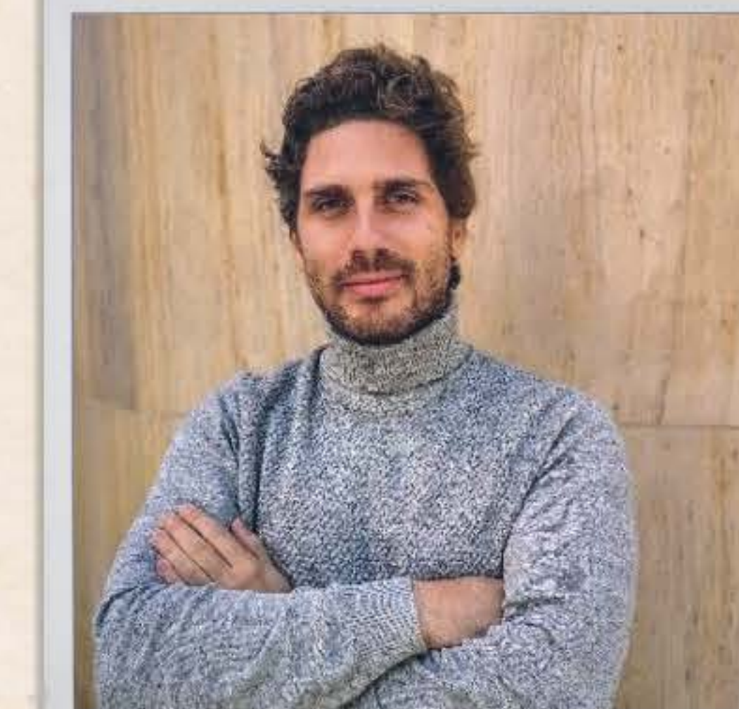
JAMIE PADEL COURTS