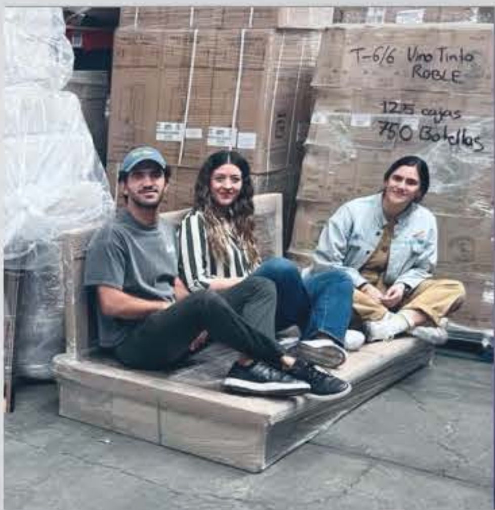
CASA SECA TEAM INTERIOR DESIGN