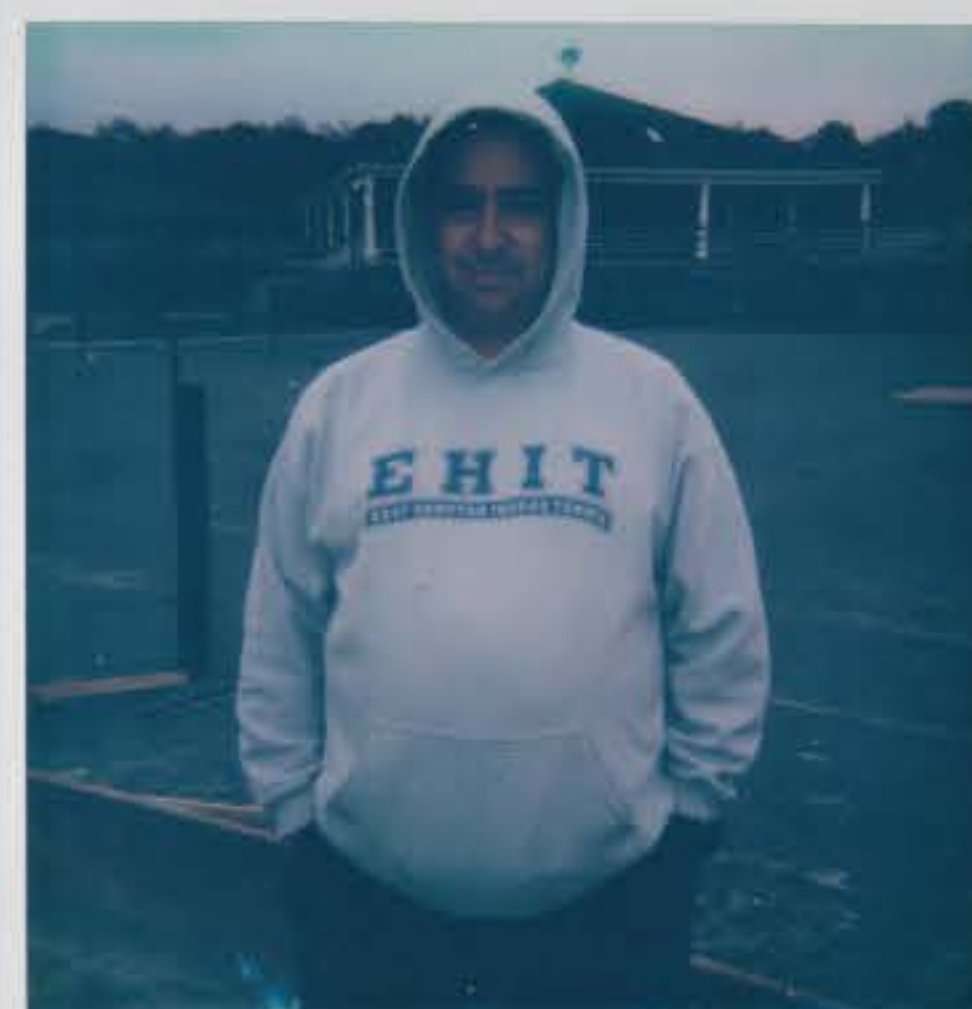
CLAUDIO KING OF CLAY