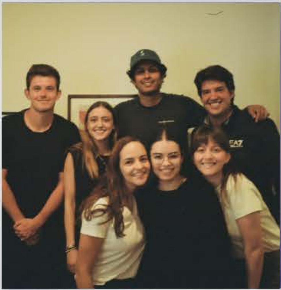
DOS OJOS TEAM LOGO MAKERS