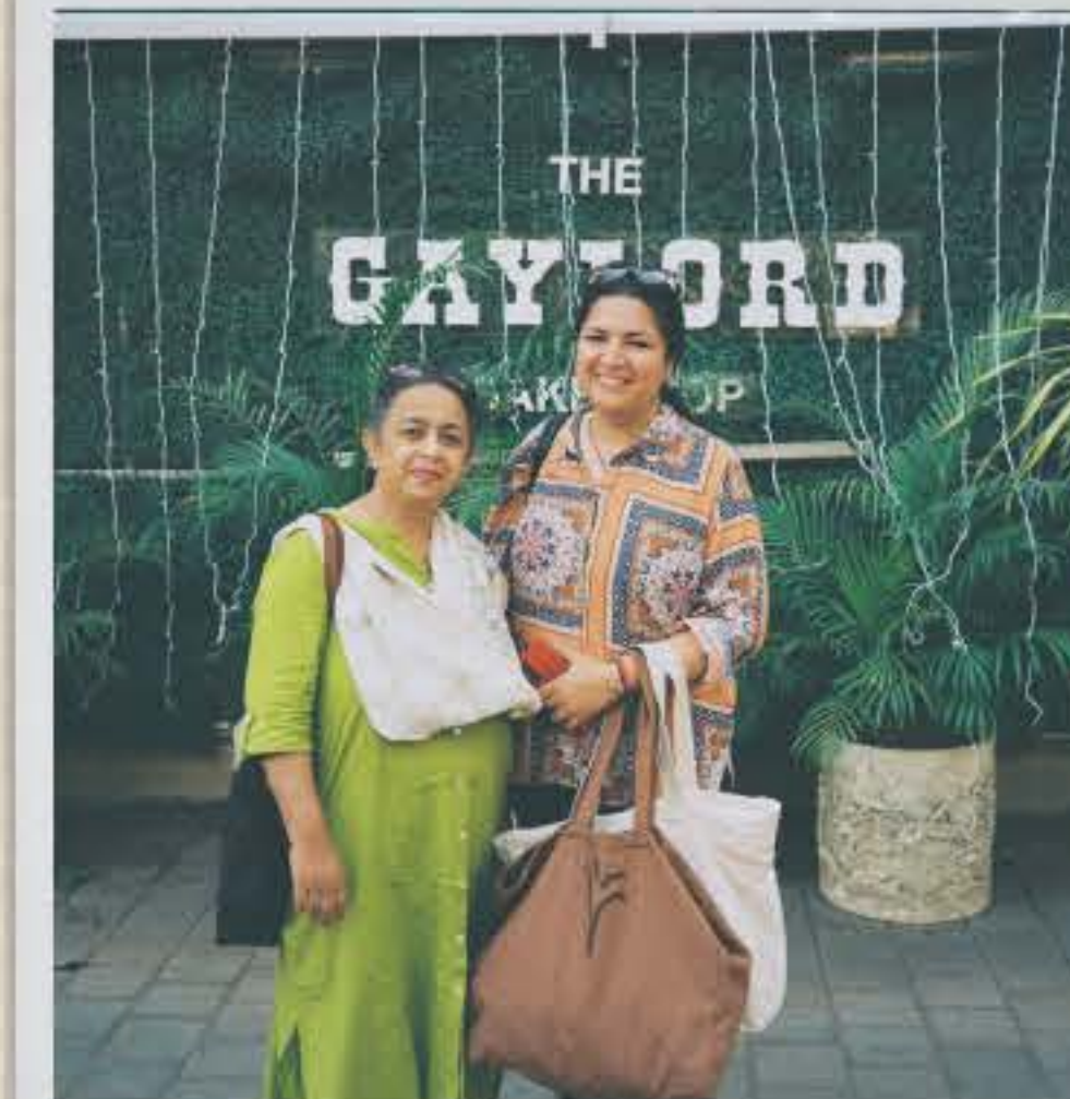
CHITRA KHUSHBOD CLOTHING TEAM