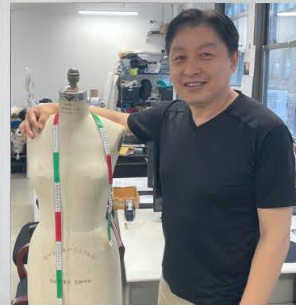
HAN PATTERN MAKER