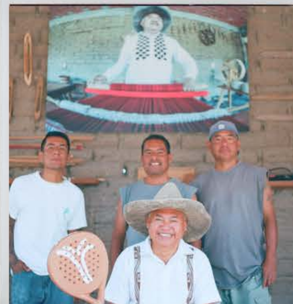
JUAN PABLO MEXICAN TEXTILE