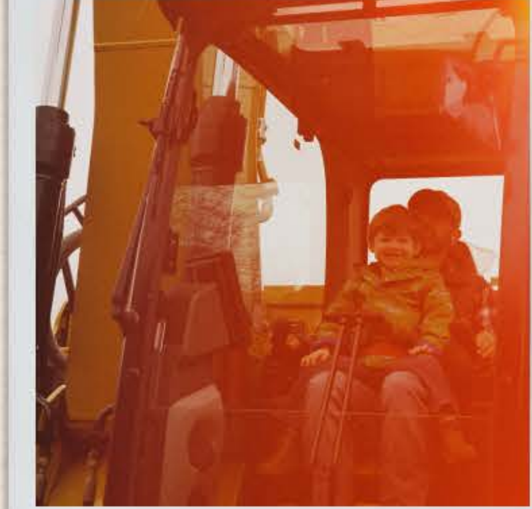
EAST END EXCAVATING