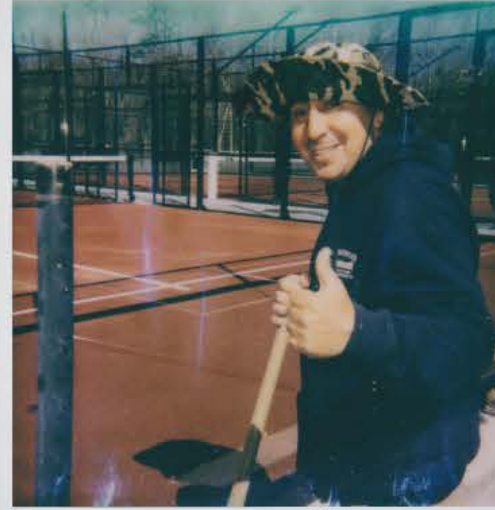
MILTON PECONIC BAY FENCE