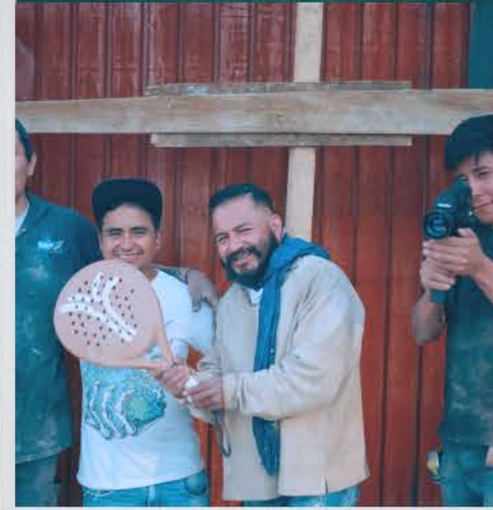
NOE GARCIA FURNITURE