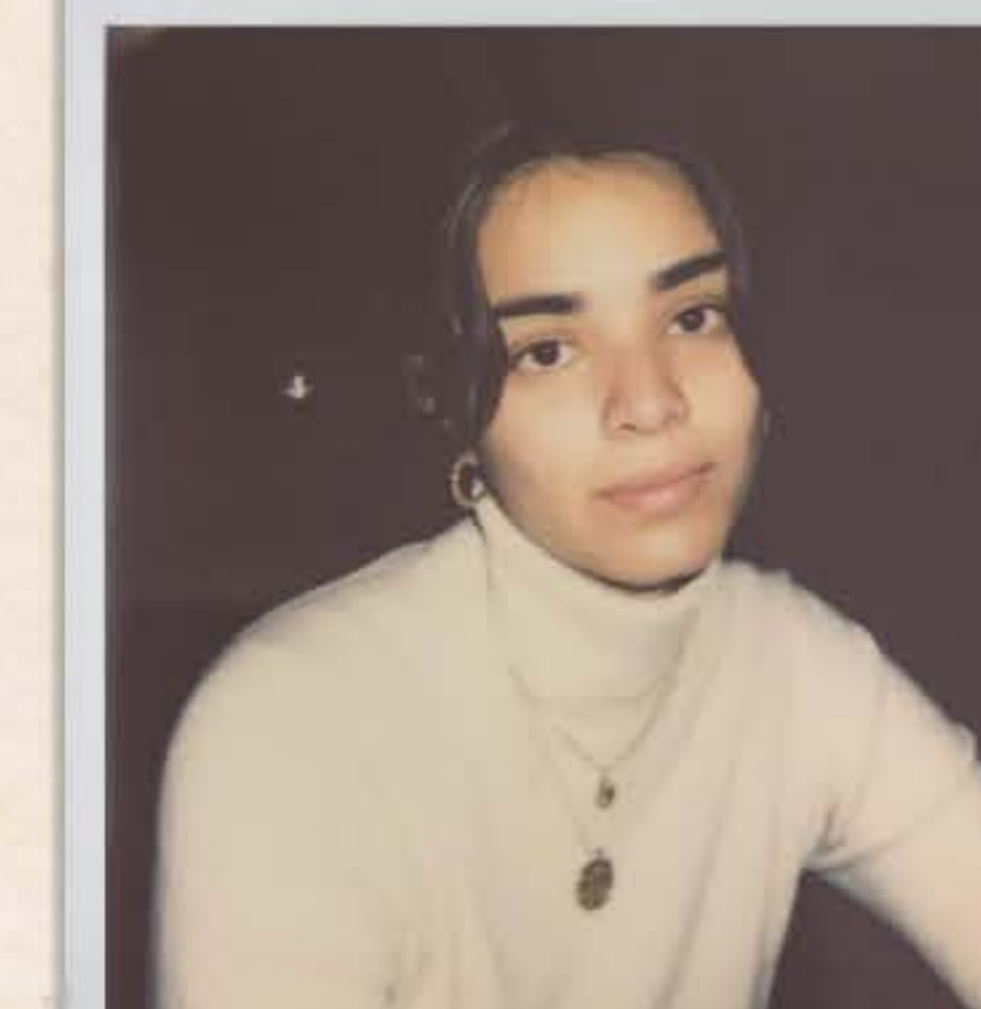
KIMAYA CREATIVE & DESIGN LEAD