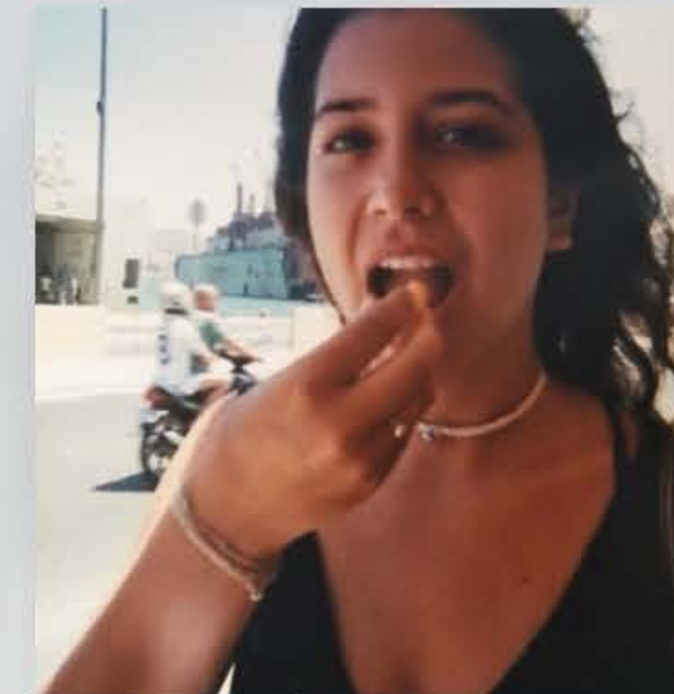
RAQUEL WEB DESIGN